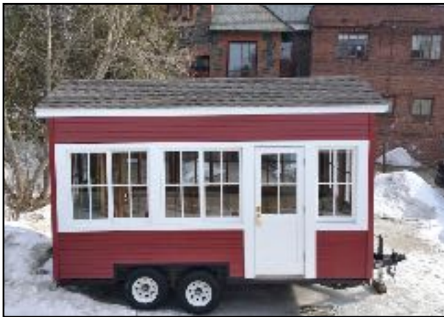
The Cure Porch on Wheels behind the Saranac Laboratory at 89 Church St.

A symbol of local heritage, the Cure Porch on Wheels is a mobile public space that hosts a wide variety of arts and culture activities. A project of Historic Saranac Lake, it serves the residents of Saranac Lake and the Adirondack region.