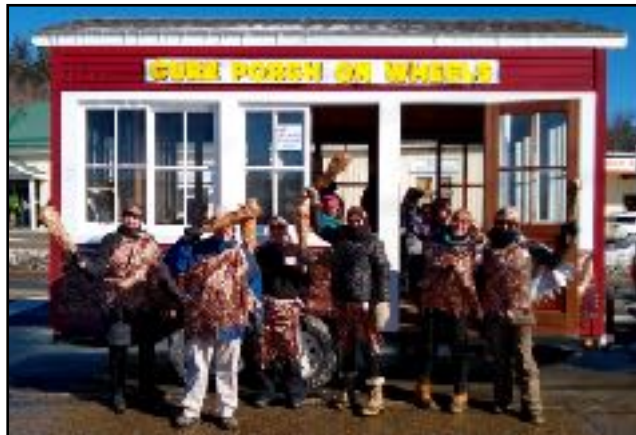
The Cure Porch on Wheels was unveiled in the 2019 Winter Carnival Parade. The theme was Prehistoric Park.

The Cure Porch on Wheels is built on a trailer, and can be towed to a variety of locations. Complete with a wheelchair lift, lights, electrical outlets, and solar power, the Porch is an affordable venue that can be used in even the most remote locations. The Porch is also heated for year-round use!