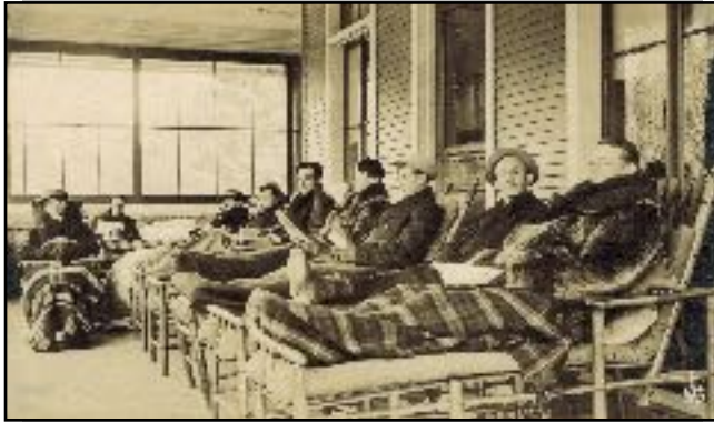
Tuberculosis patients on a cure porch.

This project draws on the American cultural tradition of a front porch—a place to visit with neighbors and enjoy the outdoors. In the early 1900s, Saranac Lake welcomed thousands of tuberculosis patients to come for the “fresh air cure.” These patients spent most of their time on specially built “cure porches” where they could experience the restorative effects of fresh air and socialize with other residents despite the contagious nature of tuberculosis. As a symbol of our local history, the Cure Porch on Wheels is a fitting venue for a variety of arts and culture programs.